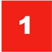
Pluspunt 3, Pluswerkboek A, blz. 46